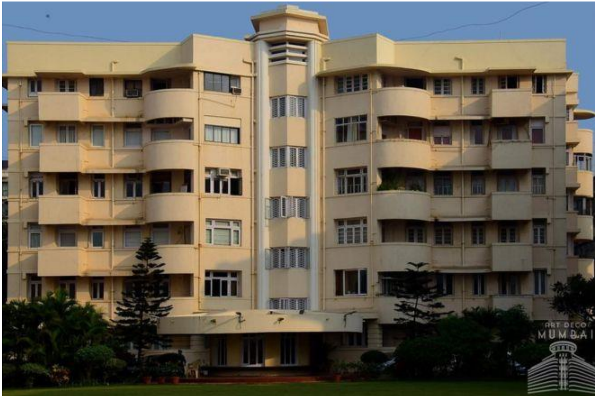
Image caption Sea Face Park has rounded and box balconies