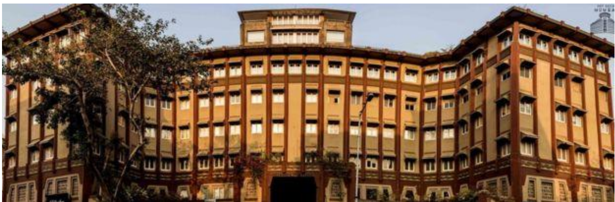
Image caption Dhanraj Mahal was once the palace of a maharajah

The area is also part of the precinct named in the "Victorian and Art Deco ensemble", a central government nomination as a Unesco World Heritage site.