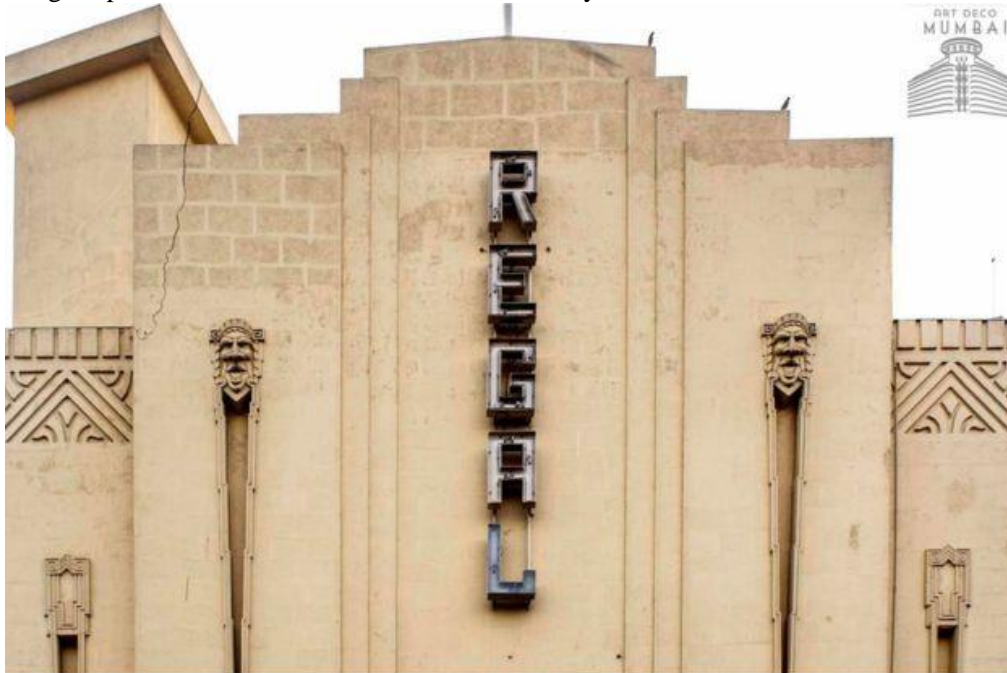
Image caption Regal cinema was Mumbai's first public art deco building

Image caption The Pai House has curvilinear balcony