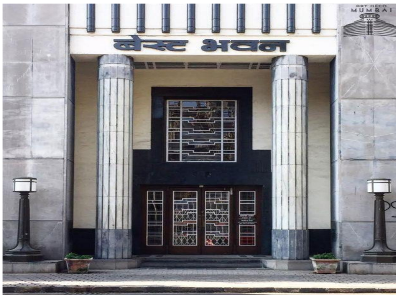
Image caption The Electric House has a grand entrance with fluted columns and brass lamps