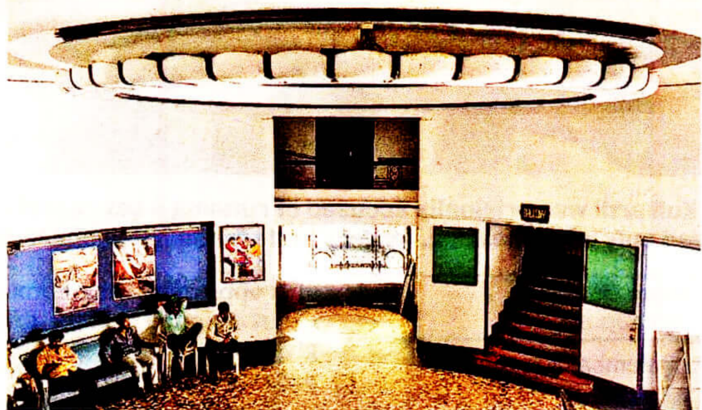
Interior view of the entrance lobby of the single screen theatre

However, Rajan struggles to maintain its architecture, according to the new demands made by its environment and infrastructure. For instance, the building is not equipped for the monsoon that the city faces every year. Where he can, Rajan adapts, and he has built his own drainage method, for instance, with pipes that spill out of the architecture and onto a blue tarpaulin underneath. But this, of course, is temporary.